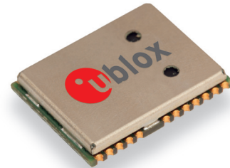
NEO-6: 12.2 x 16.0 x 2.4 mm