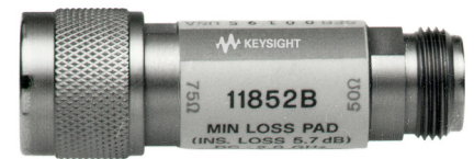
Keysight 75-ohm test accessories