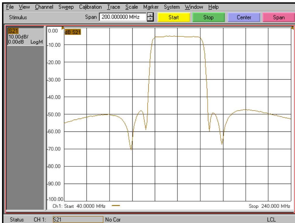
Overall Response (10 dB/div)

KR Electronics, Inc. 91 Avenel Street Avenel, NJ 07001