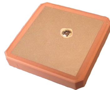
TW1015 Dimensions (mm)