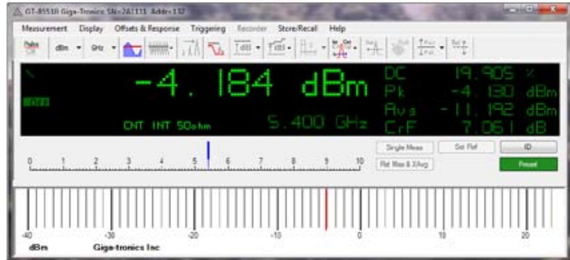
USB Peak Power Sensor software