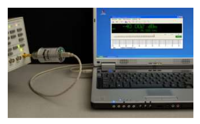
Test Setup for One Sensor Measurements