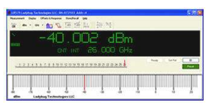
Power Meter Panel