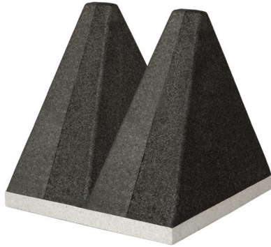
DuraSorb DSH-600H features a dual-pyramid design (shown without polystyrene white cap).