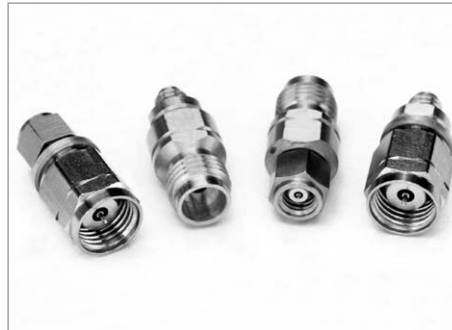
Keysight 11921E/F/G/H Adapters