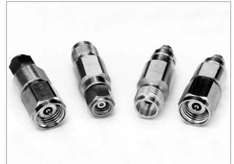
Keysight 11922A/B/C/D Adapters